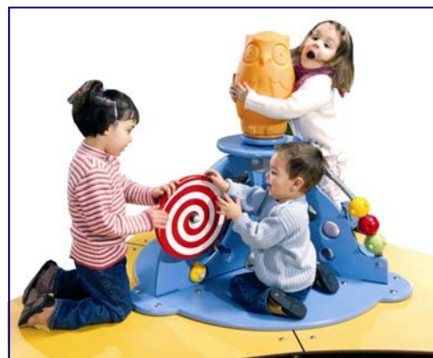
Tiboo Activity Centre

Play is a major activity for children; it can even be their main concern