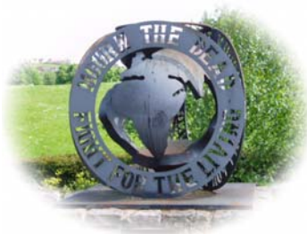
War memorial at Balbardie Park

At the end of 2005, West Lothian Council undertook to refurbish the existing, dated play area in Balbardie, Bathgate. Balbardie Park of Peace (so named because of the war memorial within the park) had existing outdoor facilities including a BMX track, skate ramps, youth shelter and basketball/football unit (the shelter and sports goals were the first from the Jupiter range installed in Scotland!) close to the local sports centre.